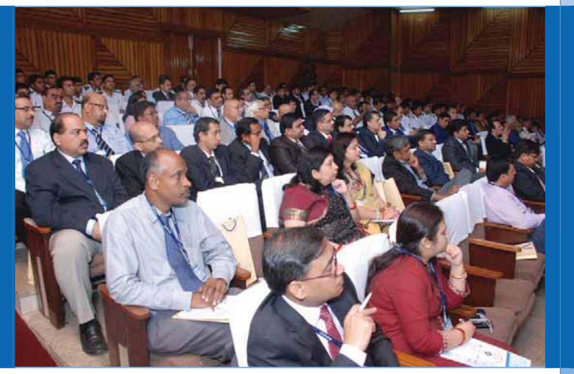
Delegates at the conference